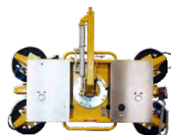
Accessories Forks, booms, winches, suction units 13