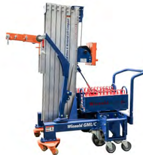
GML-C Glass and Material Lift Compact 9