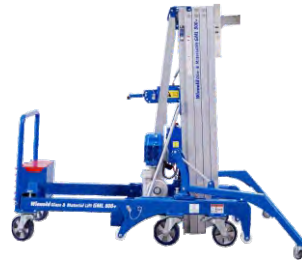
GML800+/500+ Glass and Material Lift 7