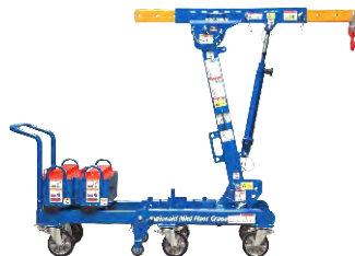
MFC Mini Floor Crane 11