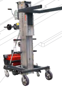
WLU-P Wienold Lift Universal Premium 5