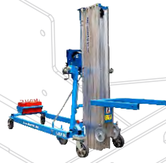
SLK Superlift with counterweights 3