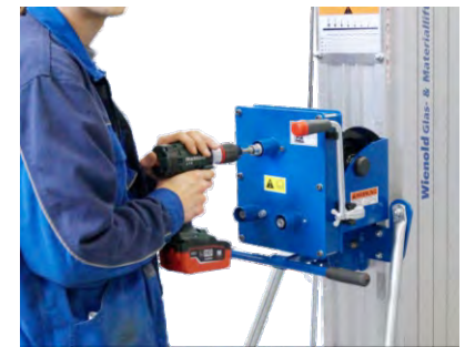
Drive : 3- step drill kit