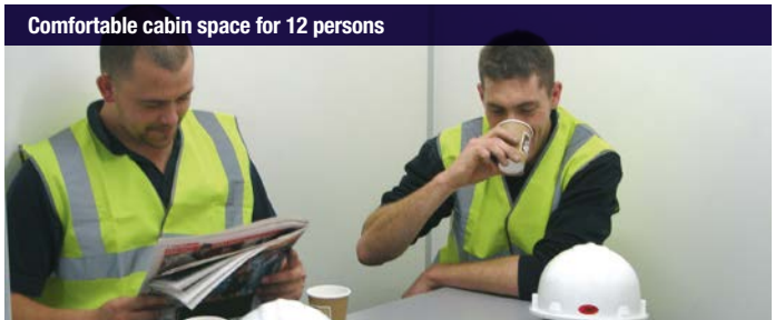
Comfortable cabin space for 12 persons