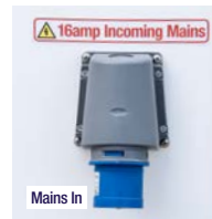
16amp Incoming Mains