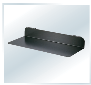
Big Toeplate Attachment BTA-12-28 / BTA-12-32: Large removable toeplate fits over standard toeplate. Available in 2 sizes; 12" x 28" and 12" x 32"