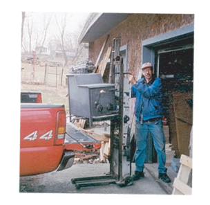
Model: RLA-HC with lift attachment removed