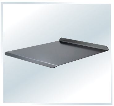
Lift Plate Attachment LPA-1: Removable 24" x 28" steel platform locks on to forks (for fork lift models only).