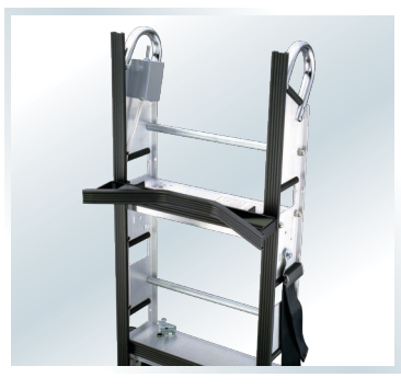
Barrel Attachment BAR-1 / BAR-2: Concave, padded brace stabilizes cylinder-shaped loads. Used for water-heaters, barrels and drums.