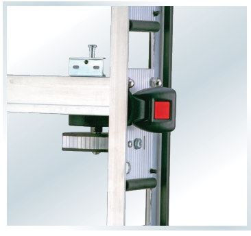
Auto-Rewind Safety Strap RW-1: 12 ft. long nylon automatic rewinding safety strap. Upper, middle and lower positions available for maximum versatility.