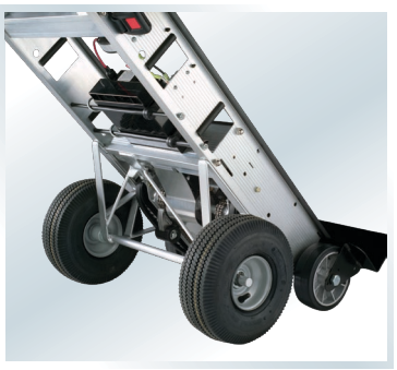
Big Wheel Attachment BWA-1: Removable pneumatic 10" tires for rolling on rough terrain. Easily snaps on/off hand truck in 2 seconds.