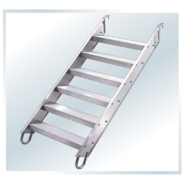
Portable Steps Custom designed aluminum steps available in various sizes to fit most delivery vehicles ranging from small pick-ups to large delivery trucks.