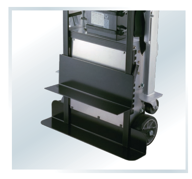
Height Adjustable Toeplate HAT-1: For moving loads with legs, such as furniture and snack vending machines.