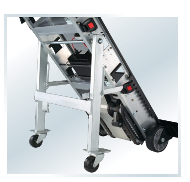
Retractable Load Support RLS-1: Wide track folding carriage legs with swivel casters. Footoperated latch allows for easy deployment without uprighting load.