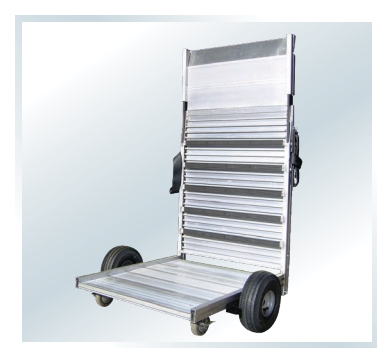
Escalera CopyCaddy™ RPA-1 / RPA-2: Delivery cart/ramp for copy machines and large electronic equipment. 2 pallet sizes and 10" extensions available. Includes all-terrain tires, and adjustable strap.