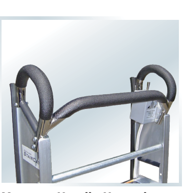
Magnum Handle Upgrade #1305 / #1307: No-slip coated handle with wider opening. Replaces standard chrome top handle. Cross-bar option available (#1307).