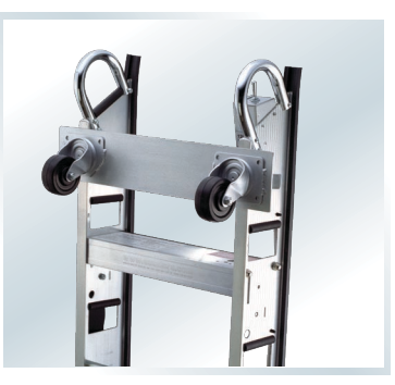
Swivel Caster Attachment SCA-1: Attaches easily to the back of the hand truck near the top handles. Allows the hand truck to lay flat and roll in a horizontal position.