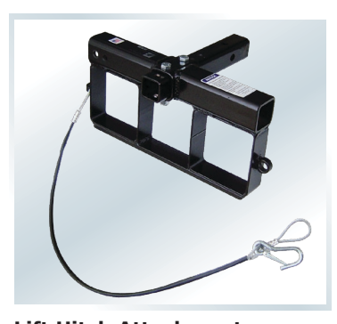
Lift Hitch Attachment LH-3: Carries Escalera Forklifts on the back of delivery vehicles. Fits standard 2" receiver (for fork lift models only).