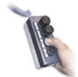
DSKE2 without extension arms