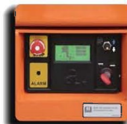
Touch Display Screen