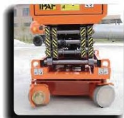
Compact Turning Radius