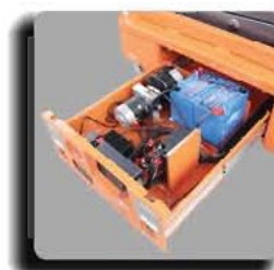
Slide Out Tray