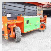
4WS (Apply to JCPT2223)