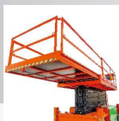
One-key Extended Platform (Apply to JCPT2223)