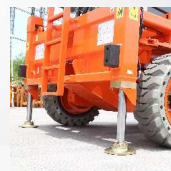
Self-leveling Hydraulic Outriggers

Model: JCPT2223DC/RTB - JCPT1823RT - JCPT1523RT - JCPT1418DC/RT - JCPT1218DC/RT